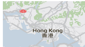
HK3 Hong Kong IBX Data Center

Copyright © 2024 Fortex Technologies inc.